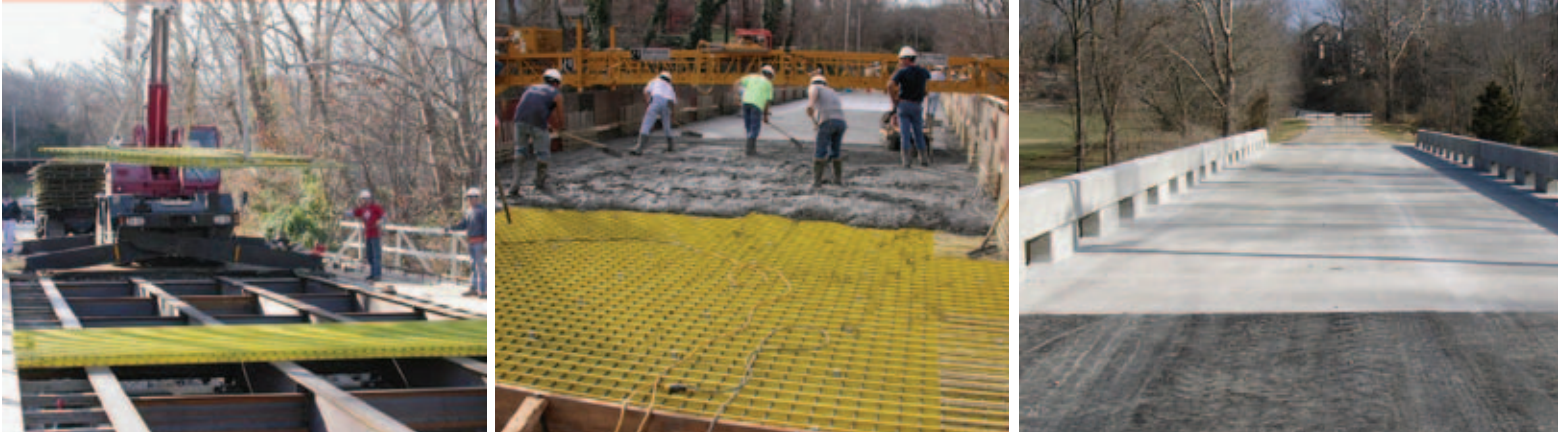
This field application in Greene County, Missouri, shows FRP panel setting and anchoring. The bridge was reconstructed in only five days.